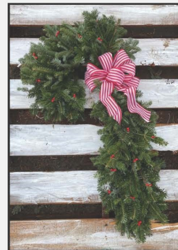
Candy Cane Wreath

Made with Fraser Fir, accented with red berries. 18"x 36" $35