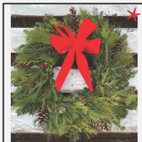
"The Natural" Wreath

Made with Fraser Fir, White Pine and Aborvitae, pine cones & berries. 22" (Door Size) $45 ★ 32" $55