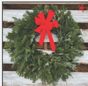
Classic Fraser Fir Wreath

Made with Fraser Fir. Fragrance lasts all season. 26" (Door Size) $25 ★ 36" $38 42" $50