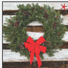
Premium Fraser Fir Wreath

Made with Fraser Fir. Accented with glitzy pine cones and berries. 26" (Door Size) $30 ★ 36" $42