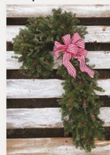
Candy Cane Wreath

Fraser Fir, accented with red berries. 18"x 36" $35