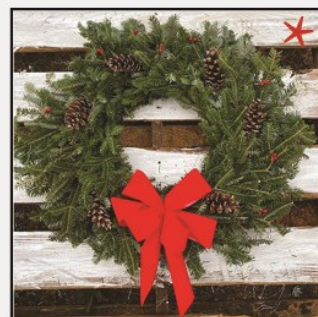
Premium Fraser Fir Wreath

Made with Fraser Fir. Accented with glitzy pine cones and berries. 26" (Door Size) $30 ★ 36" $40