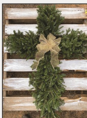
Large Fraser Fir Cross Wreath

Made with Fraser Fir, accented with a gold bow. 36"x 48" $50