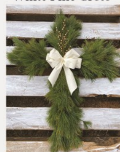
White Pine Cross

Soft White Pine, accented with a gold bow and gold berries.