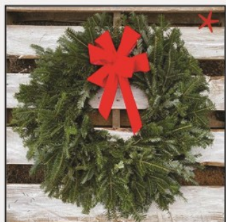
Classic Fraser Fir Wreath

Made with Fraser Fir. Fragrance lasts all season. 26" (Door Size) $20 ★ 36" $30 42" $45 55" $75 72" $110