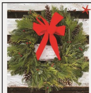
"The Natural" Wreath

Made with Fraser Fir, White Pine and Arborvitae, pine cones & berries. 22" (Door Size) $45 ★ 32" $55