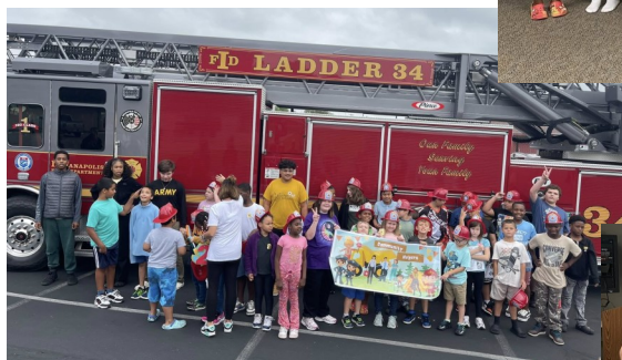
Ladder 34 and crew