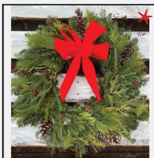
"The Natural" Wreath

Made with Fraser Fir, White Pine and Arborvitae, pine cones & berries. 22" (Door Size) $45 ★ 32" $55