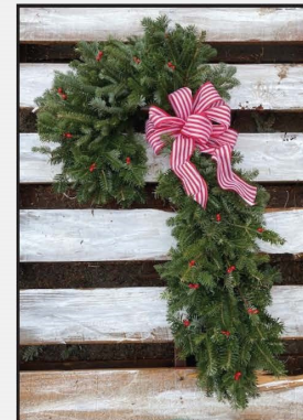
Candy Cane Wreath

Made with Fraser Fir, accented with red berries. 18"x 36" $35