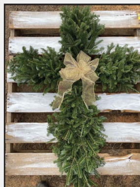
Large Fraser Fir Cross Wreath

Made with Fraser Fir, accented with a gold bow. 36"x 48" $55