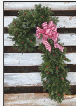
Candy Cane Wreath

Made with Fraser Fir, accented with red berries. 18"x 36" $35