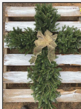
Large Fraser Fir Cross Wreath

Made with Fraser Fir, accented with a gold bow. 36"x 48" $55