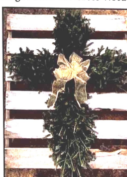
Large Fraser Fir Cross Wreath

Made with Fraser Fir, accented with a gold bow. 36"x 48" $60