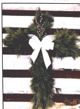
White Pine Cross

Soft White Pine, accented with a gold bow and gold berries. 30"x 36" $38