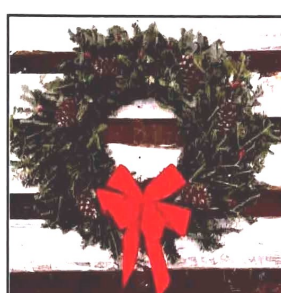
Premium Fraser Fir Wreath

Made with Fraser Fir. Accented with glitzy pine cones and berries. 26" (Door Size) $35 36" $50