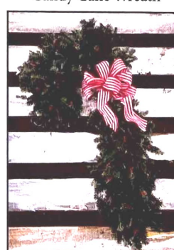
Candy Cane Wreath

Made with Fraser Fir, accented with red berries. 18"x 36" $40