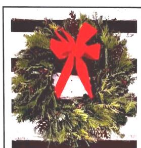
"The Natural" Wreath

Made with Fraser Fir, White Pine and Aborvitae, pine cones & berries. 22" (Door Size) $48 32" $65