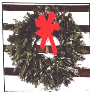
Classic Fraser Fir Wreath

Made with Fraser Fir. Fragrance lasts all season. 26" (Door Size) $30 36" $45 42" $60