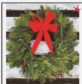
"The Natural" Wreath

Made with Fraser Fir, White Pine and Arborvitae, pine cones & berries. 22" (Door Size) $45 ★ 32" $55