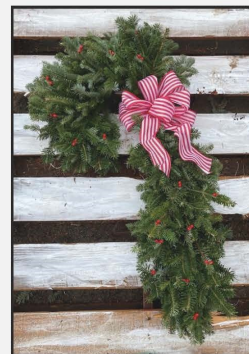
Candy Cane Wreath

Made with Fraser Fir, accented with red berries. 18"x 36" $35