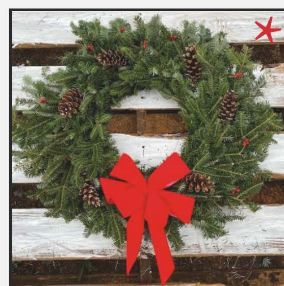
Premium Fraser Fir Wreath

Made with Fraser Fir. Accented with glitzy pine cones and berries. 26" (Door Size) $35 ★ 36" $45