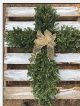
Large Fraser Fir Cross Wreath

Made with Fraser Fir, accented with a gold bow. 36"x 48" $55