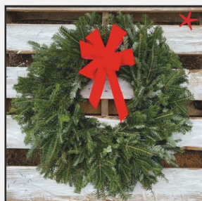
Classic Fraser Fir Wreath

Made with Fraser Fir. Fragrance lasts all season. 26" (Door Size) $28 ★ 36" $40 42" $55