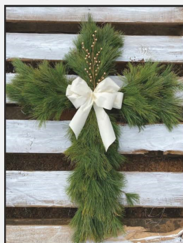
White Pine Cross

Soft White Pine, accented with a gold bow and gold berries. 30"x 36" $35