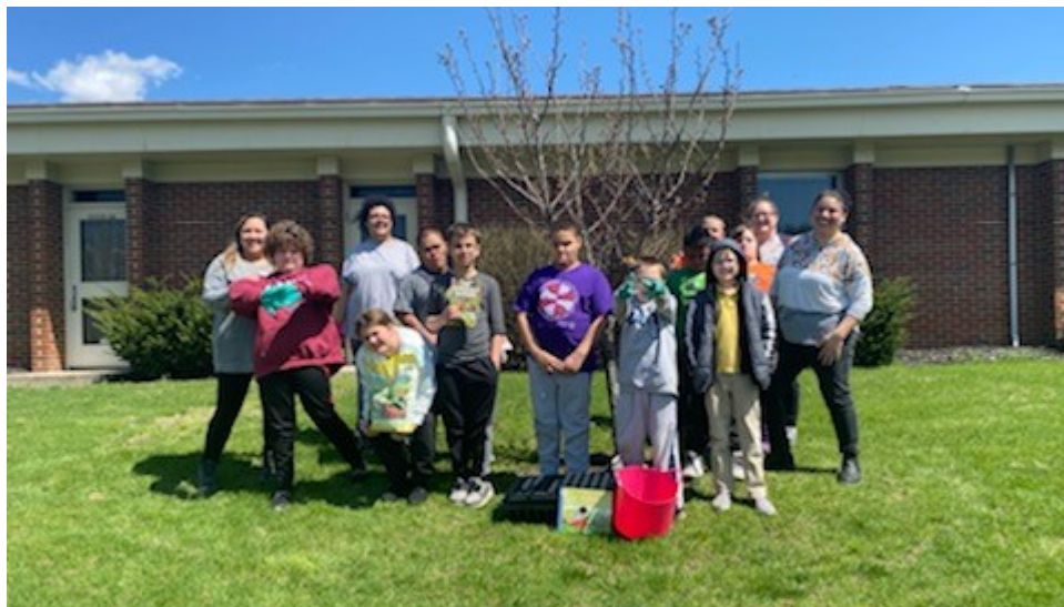
Gardening Club started on National Gardening Day.